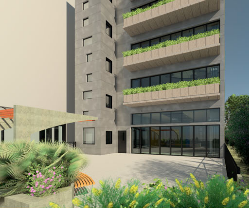
▲ Rear Yard View Roof View ▼